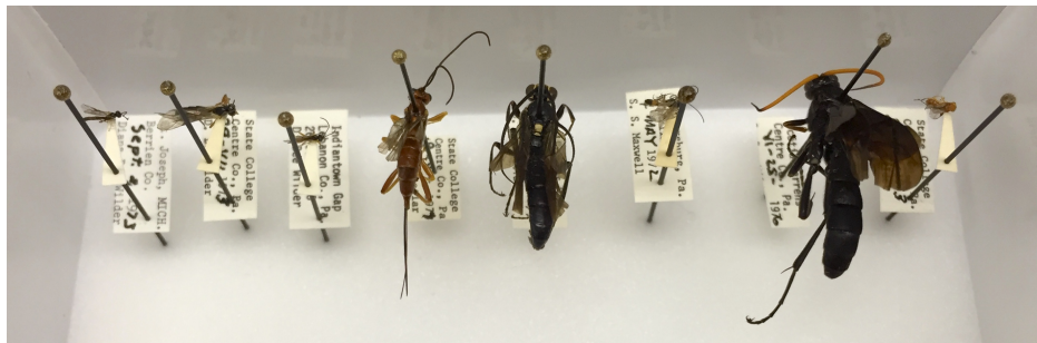
Figure 1: Heterogeneous specimen types organized inside a unit tray; note that labels are all oriented so that they can be read in one view. Specimens are placed in unit tray beginning in the upper left corner.

Pinned specimens should be organized efficiently in unit trays—tightly packed and in a straight line but not touching anything—ideally one species per tray. Labels should be oriented consistently, such that they can be read in one view (Figure 1). One should be able to remove/insert a specimen into a tray without risk of touching other specimens or the tray itself.