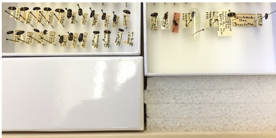
Figure 2: Empty space filled with unit tray (left) or foam spacers (right). The trays in this drawer are secure.